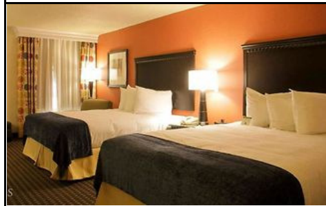
$95.00 room rate valid 7/26 - 7/29/18