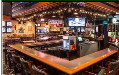
Reservation deadline: 7/12/18