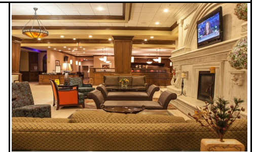
Dancing is ALL under one roof