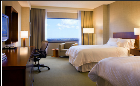
Limited amount of rooms available

WESTIN HOTELS & RESORTS Convention Hotel