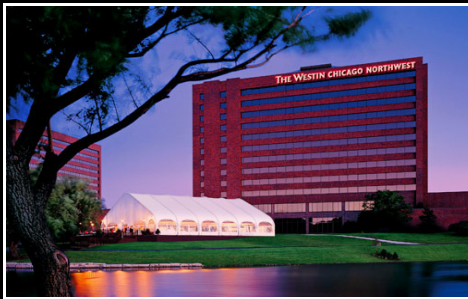
$89.00 room rate valid 7/23 - 7/30/14